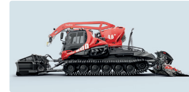
PB 600 Polar PB 800