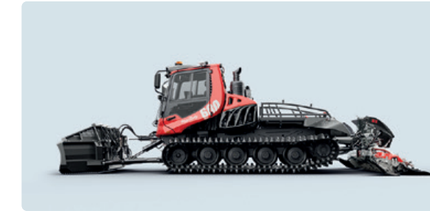
PB 600 Polar PB 800